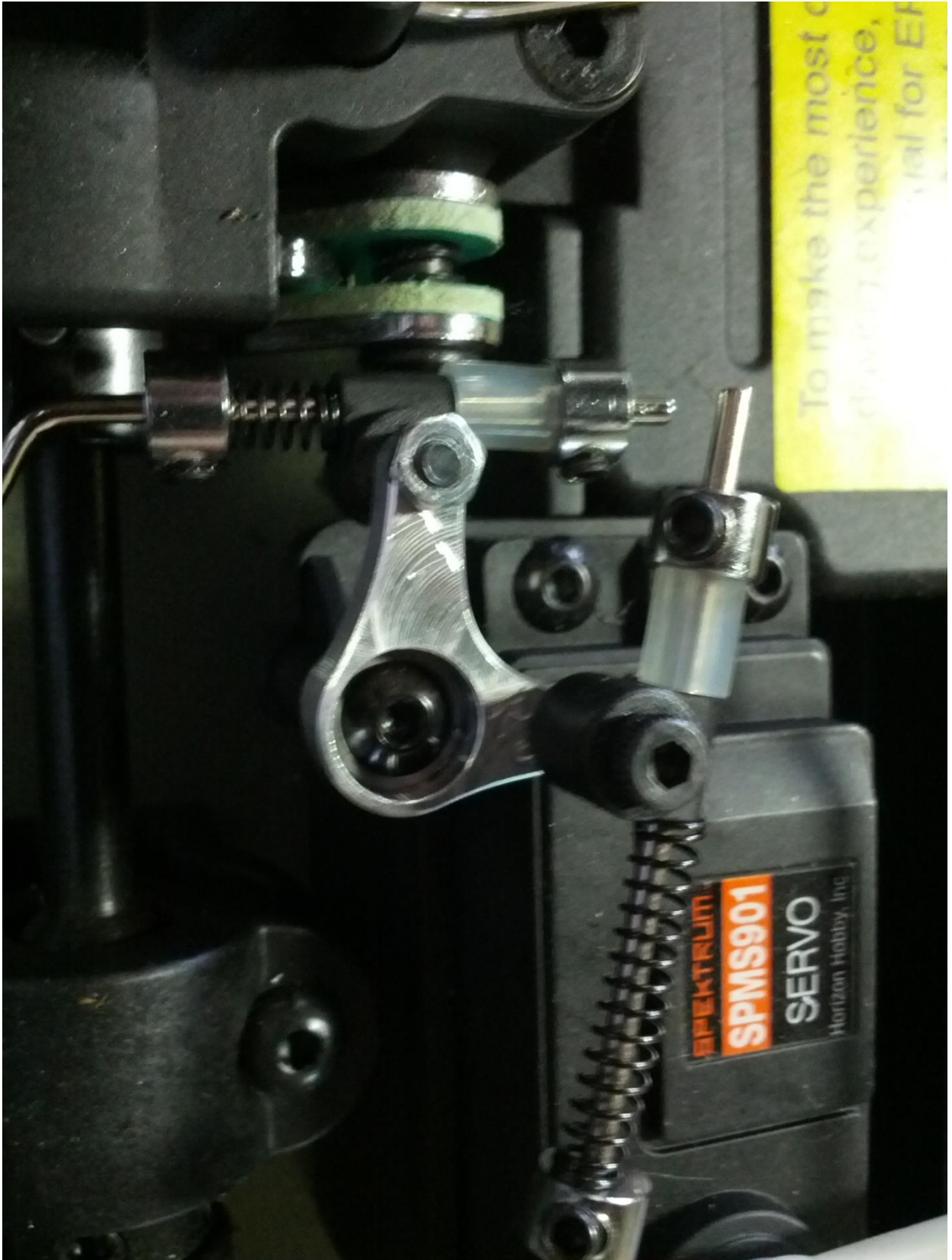
15. Your DBXL is now ready for use